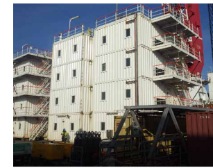
ADDITIONAL PERMANENT LIVING QUARTERS