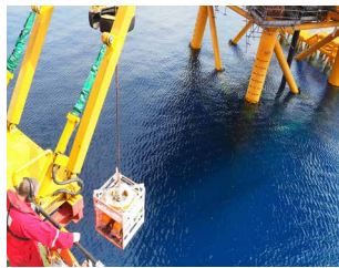
SPLASH ZONE / SUBSEA OPERATIONS